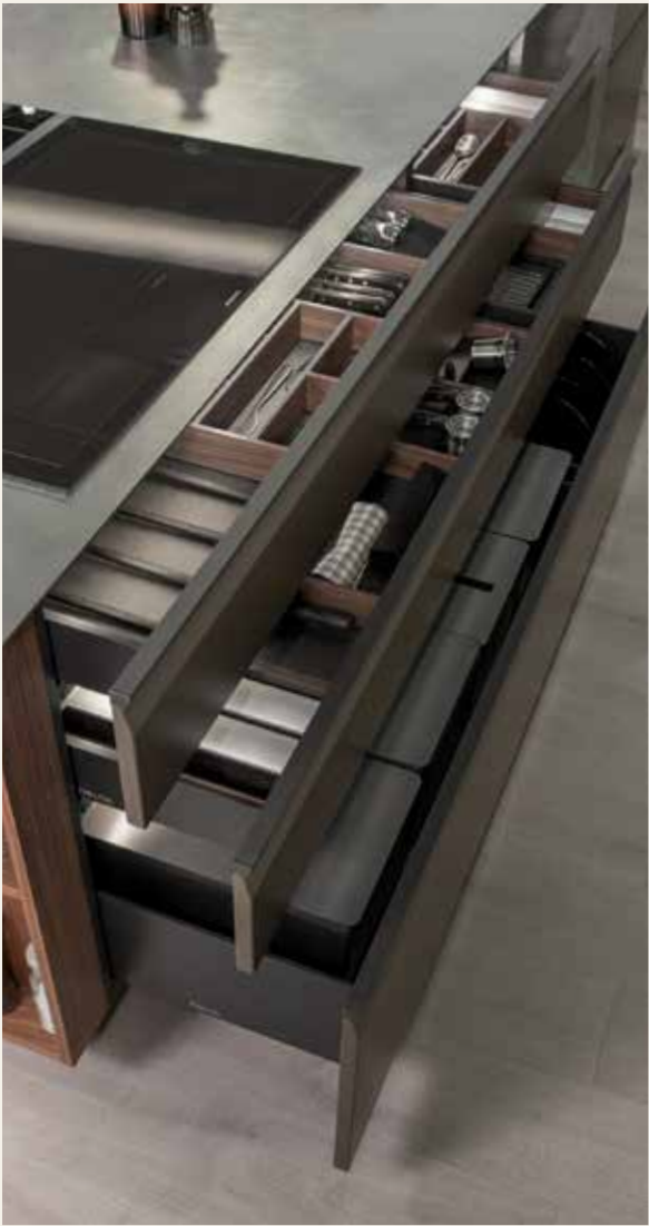
LARGE DRAWERS AND DEEP TRAYS, PROVIDE DISCREET STORAGE BY CONCEALING RECYCLING ITEMS, CUTLERY TRAY AND ORGANISER.