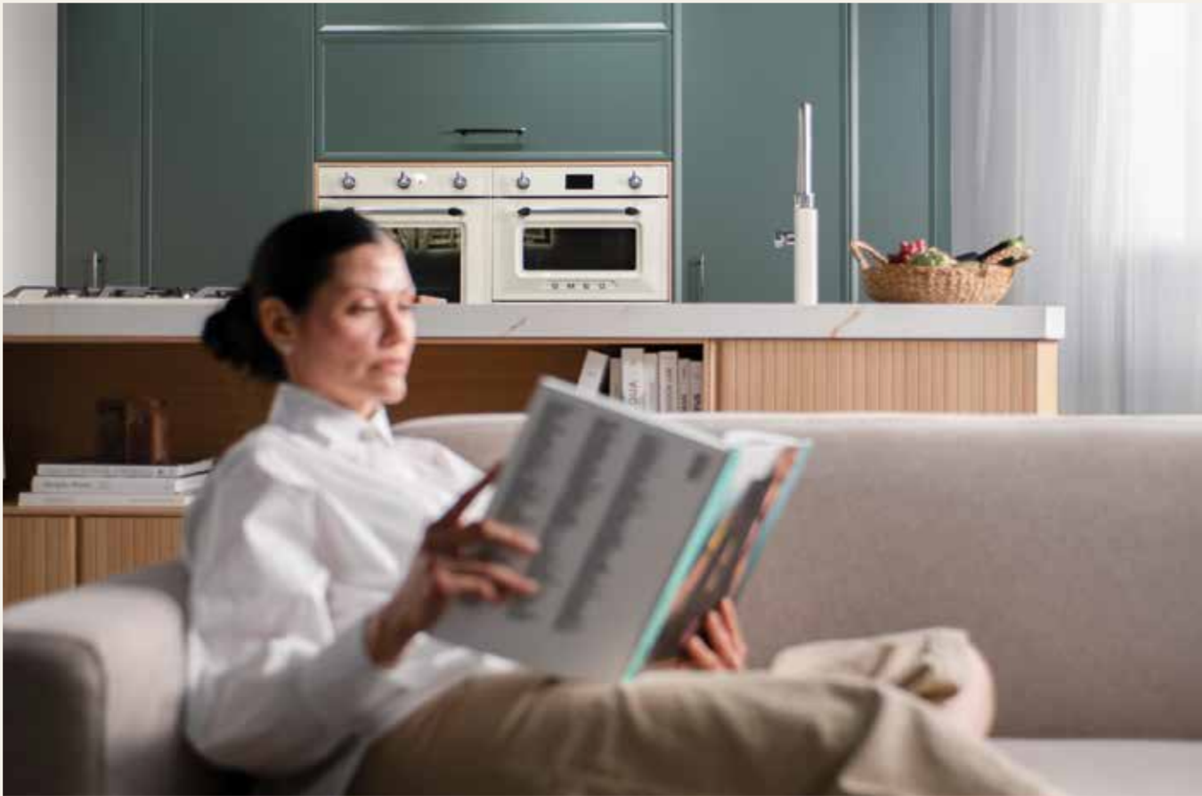
THE OPEN-PLAN KITCHEN SHARES A SPACIOUS AND DIAPHANOUS ENVIRONMENT WITH THE LIVING ROOM, CREATING A NUCLEUS AROUND WHICH THE LIFE OF THE HOME IS ARTICULATED.