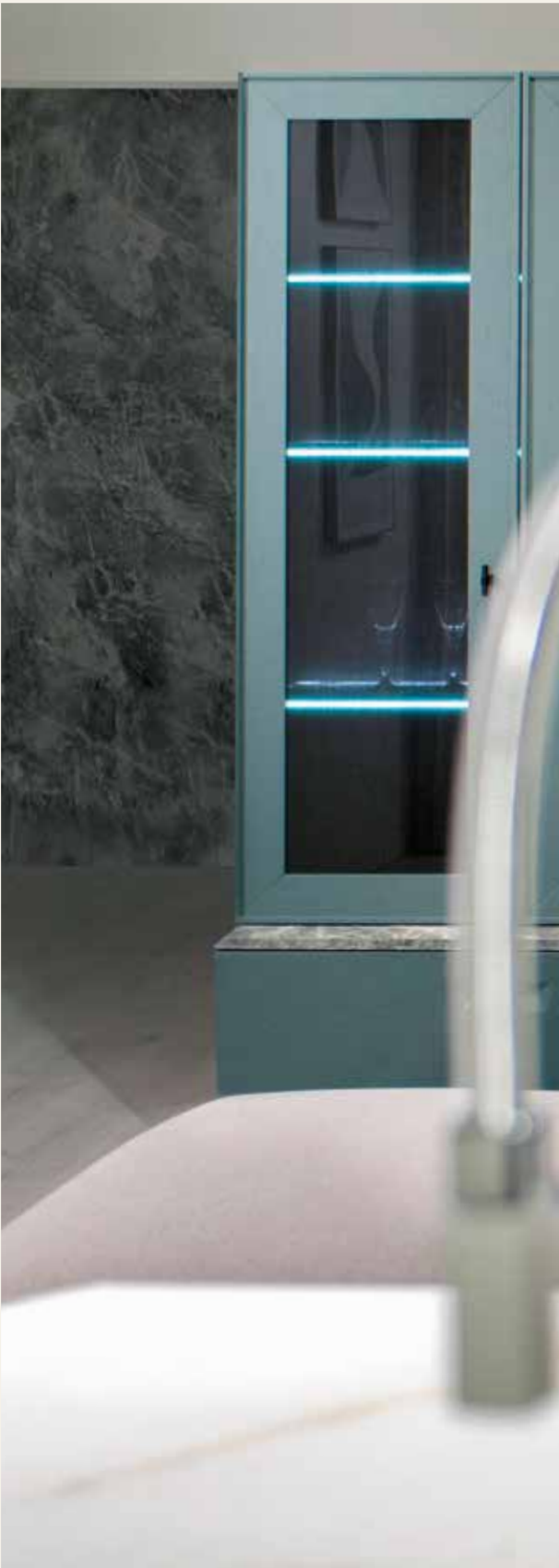
THE LINES OF THE FURNITURE CONTRIBUTE TO ITS FULL INTEGRATION IN AN OPEN, MULTI-PURPOSE SPACE.