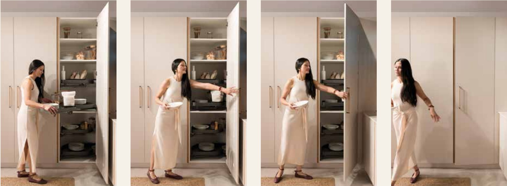
THE VERSATILITY OF THE DRAWERS, THE PULL-OUT CORNER UNIT AND ITS ORGANISATION SYSTEM TURN THE KITCHEN INTO A SPACE WITH GREAT STORAGE CAPACITY.