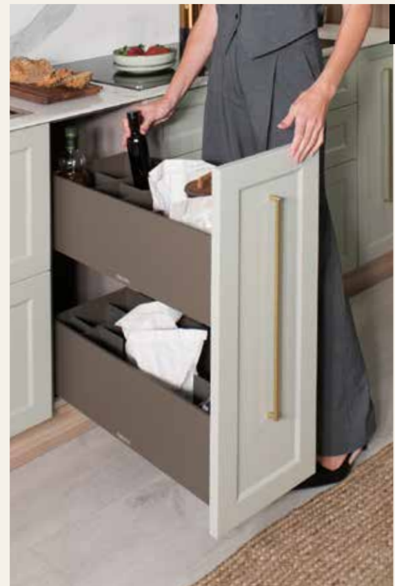
PULL-OUT STORAGE ELEMENTS THAT HELP TO KEEP THINGS TIDY IN SMALL SPACES.