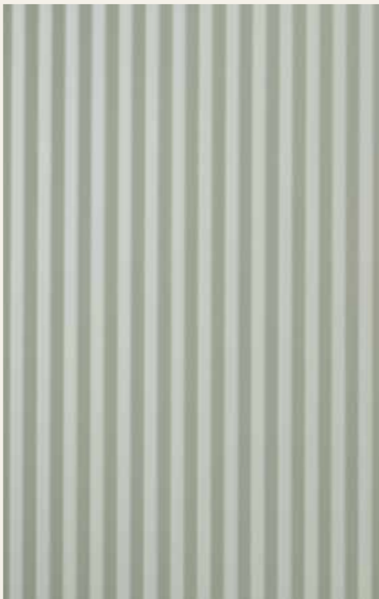
EXTERIOR MISURI DOOR DETAIL.