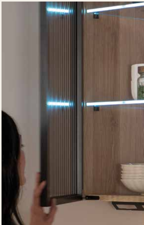
THE CONCEALED HINGES AND INTEGRATED LED LIGHTS GIVE EXCLUSIVITY TO THE SET.