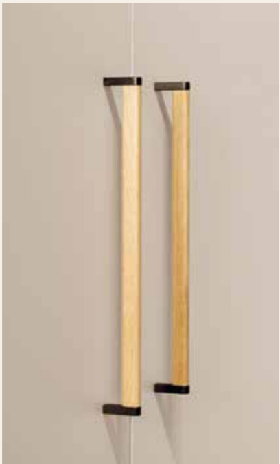
THE OAK HANDLES ARE A SIMPLE DETAIL THAT ENHANCES THE SOPHISTICATED AND WELCOMING DESIGN.