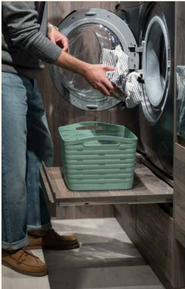
IN THE LAUNDRY AREA, THE APPLIANCES ARE RAISED FOR GREATER ERGONOMICS AND EASE OF USE, WITH A PULL-OUT SHELF AS A SUPPORT.