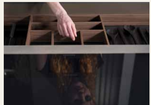
THE CUTLERY TRAY MADE OF WALNUT, AND ANTHRACITE, HAS PERSONALISED DETAILS THAT MAKE IT EASY TO LOCATE THE ELEMENTS.

“It is the place where we come together and share experiences. I value it deeply a space that always adapts to me, no matter the moment.”