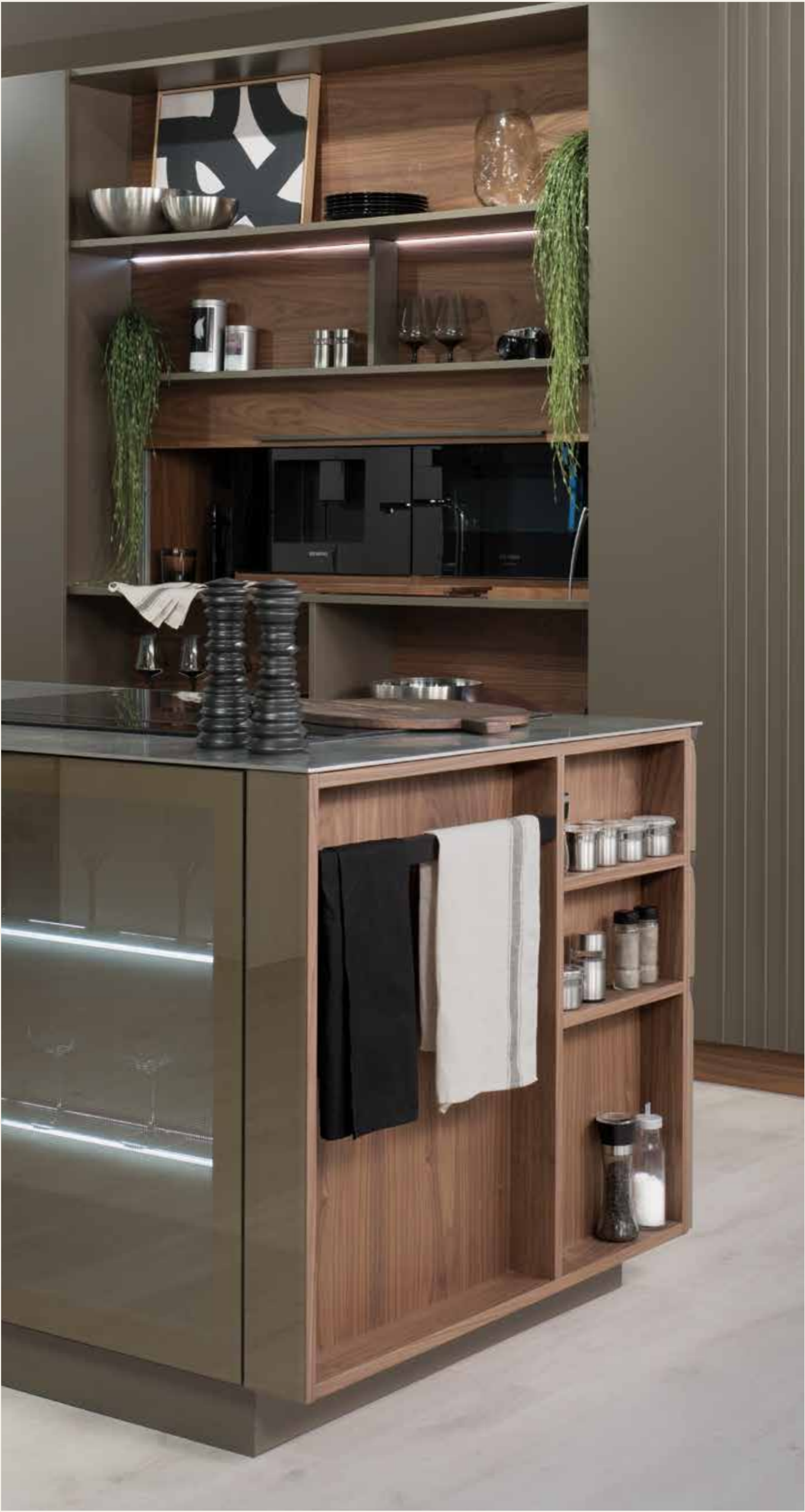
ON THE SIDE, HAS CREATED AN EXCLUSIVE WALNUT SHELF WITH STORAGE TO OPTIMISE THE SPACE.