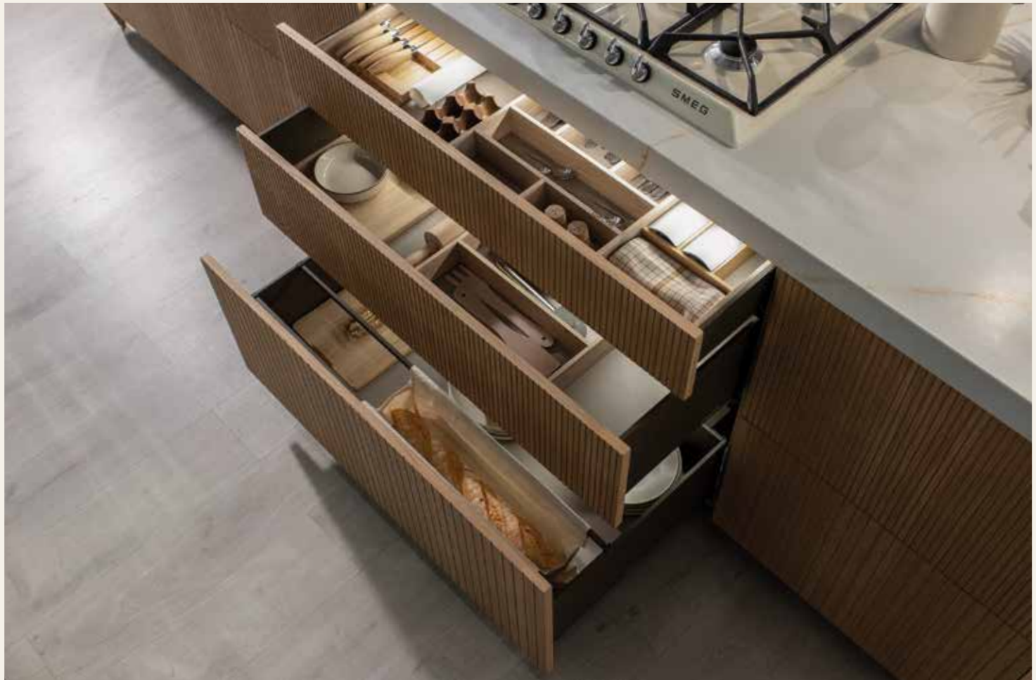
THE DRAWER IN EXCLUSIVE COCOA COLOUR EQUIPPED WITH ACCESSORIES SUCH AS THE CUTLERY TRAY, THE MADE-TO-MEASURE ORGANISER AND WITH INTERIOR LIGHTING, FACILITATES THE ORGANISATION AND LOCATION