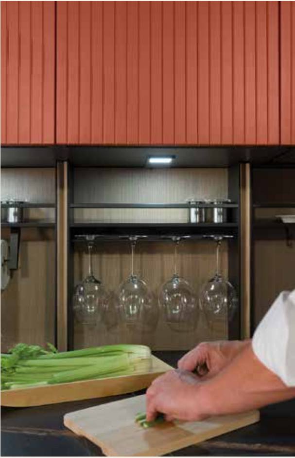
DETAIL OF THE SHELF WITH INTEGRATED BLACK ALUMINIUM SHELVES AND OAK BEVELLED STRIPS