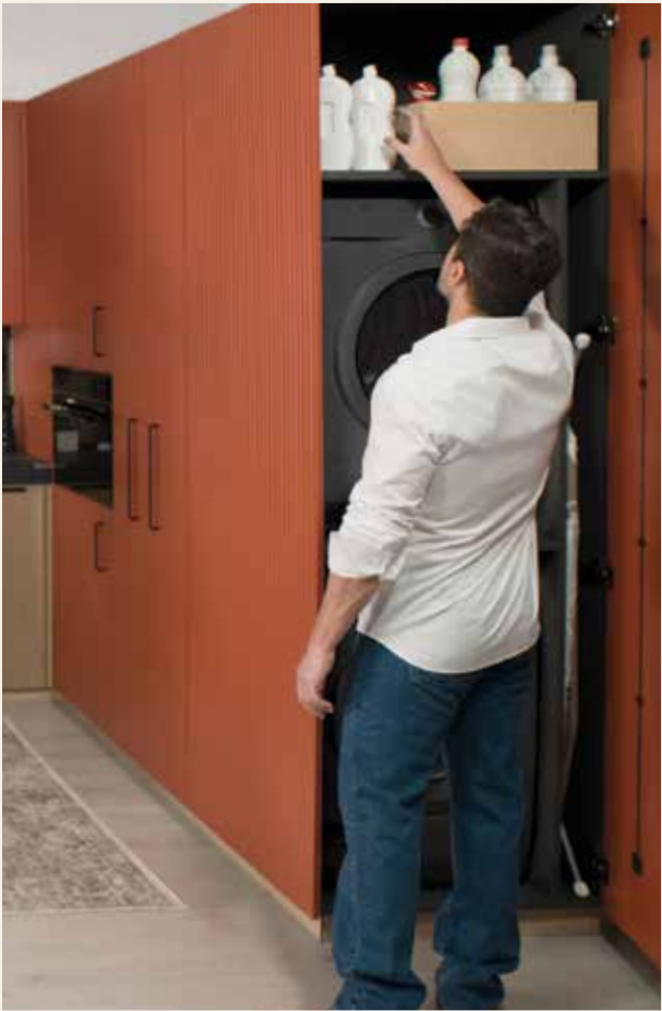
THE LAUNDRY AREA IS HIDDEN IN A CUSTOMISED AND TIDY SPACE.