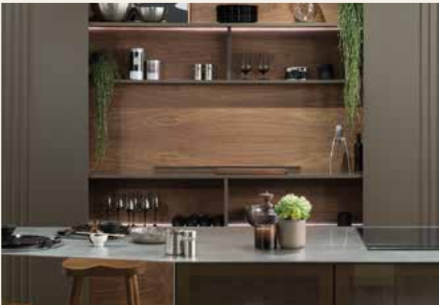
THE COFFEE MACHINE AND OVEN AREA IS CONCEALED BEHIND THE RETRACTABLE VERTICAL SLIDING DOOR, LEAVING THE FRONT CLEAN.

“My kitchen reflects my way of life, independent and always on the move. It’s a space that adapts effortlessly to each moment.”