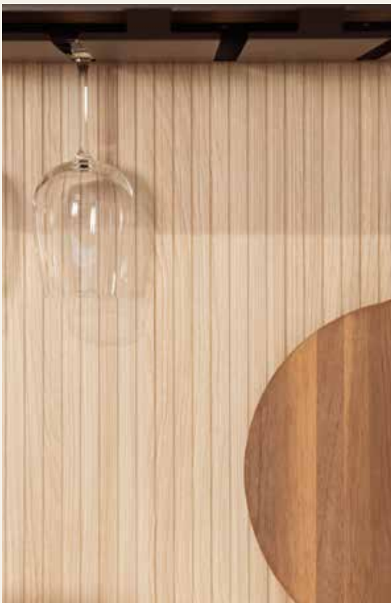
THE BOISERIE PANELLED WALL PROVIDES A VISUAL BALANCE BETWEEN MODERNITY, SOPHISTICATION AND LIGHTNESS.