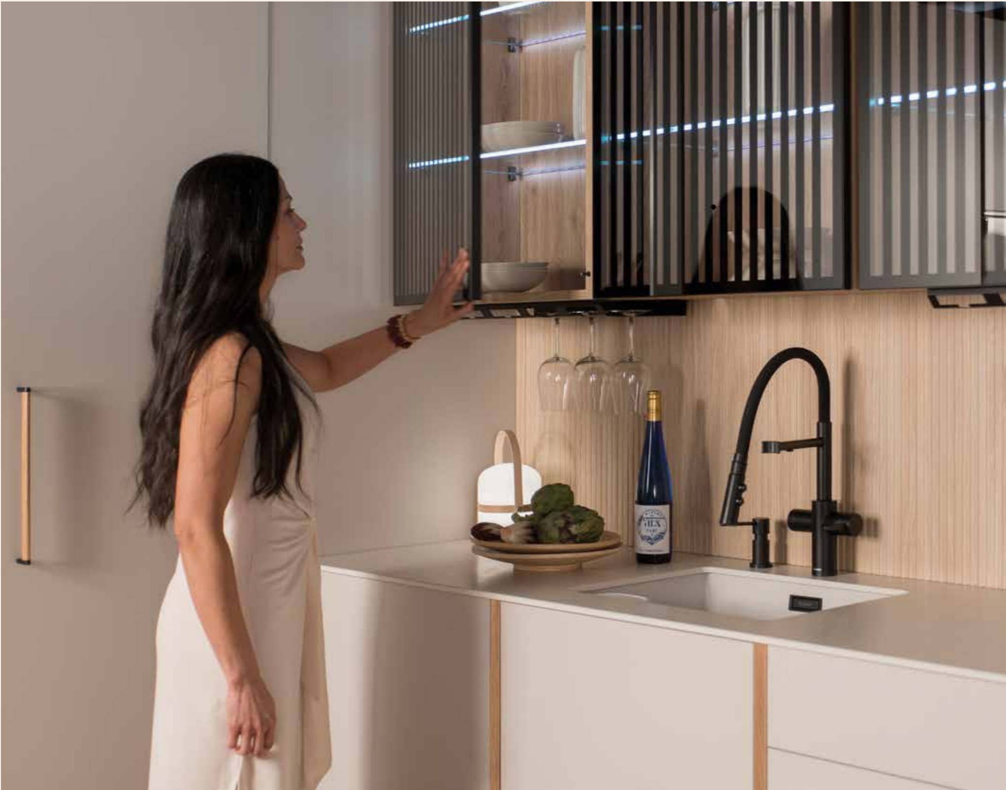
THE BLACK 181 DISPLAY CASE WITH SLATTED GLASS, WHICH COMBINES OPACITY AND TRANSPARENCY, ADDS DEPTH AND OFFERS CLEAN LINES.