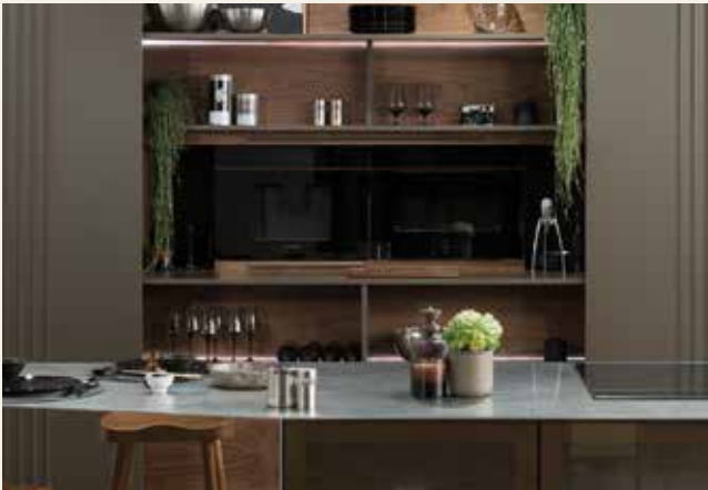
THE DISPLAY CABINET WITH BRONZE-COLOURED GLASS DOORS AND BACKLIT SHELVES IS A DETAIL OF AMBIENT LIGHTING.