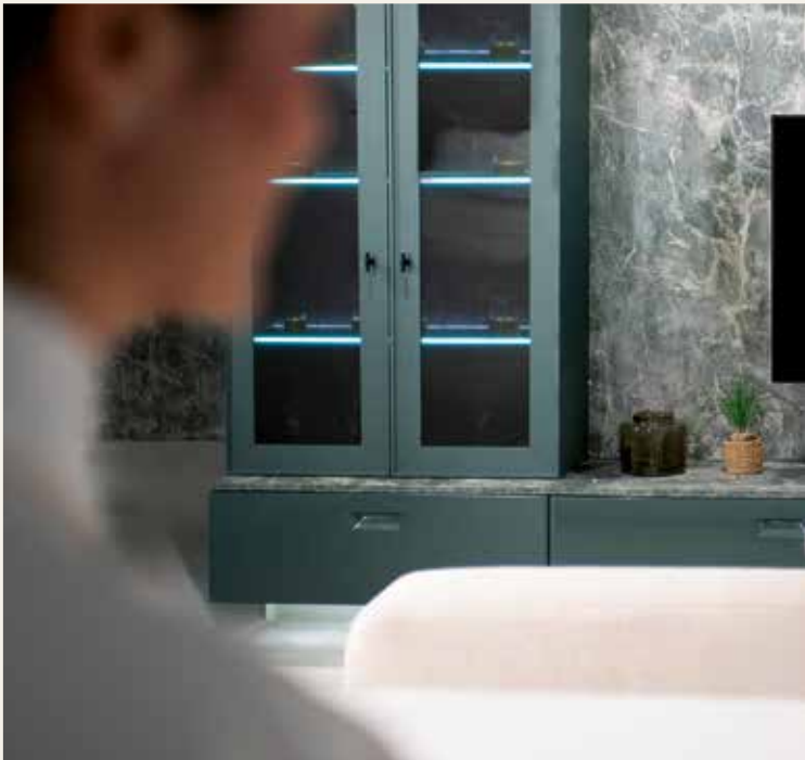
THE SHOWCASE SERVES THE KITCHEN AND LIVING ROOM, BRINGING LIGHT INTO THE ROOM WITH ITS INTERIOR LIGHTING.