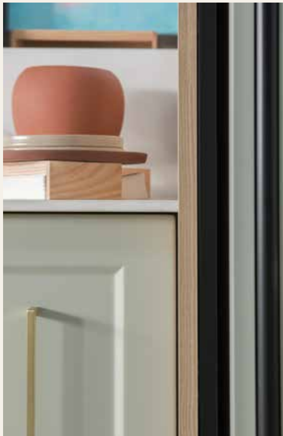
THE ENCLOSURE IS COMPLETELY HIDDEN IN THE STRUCTURE.