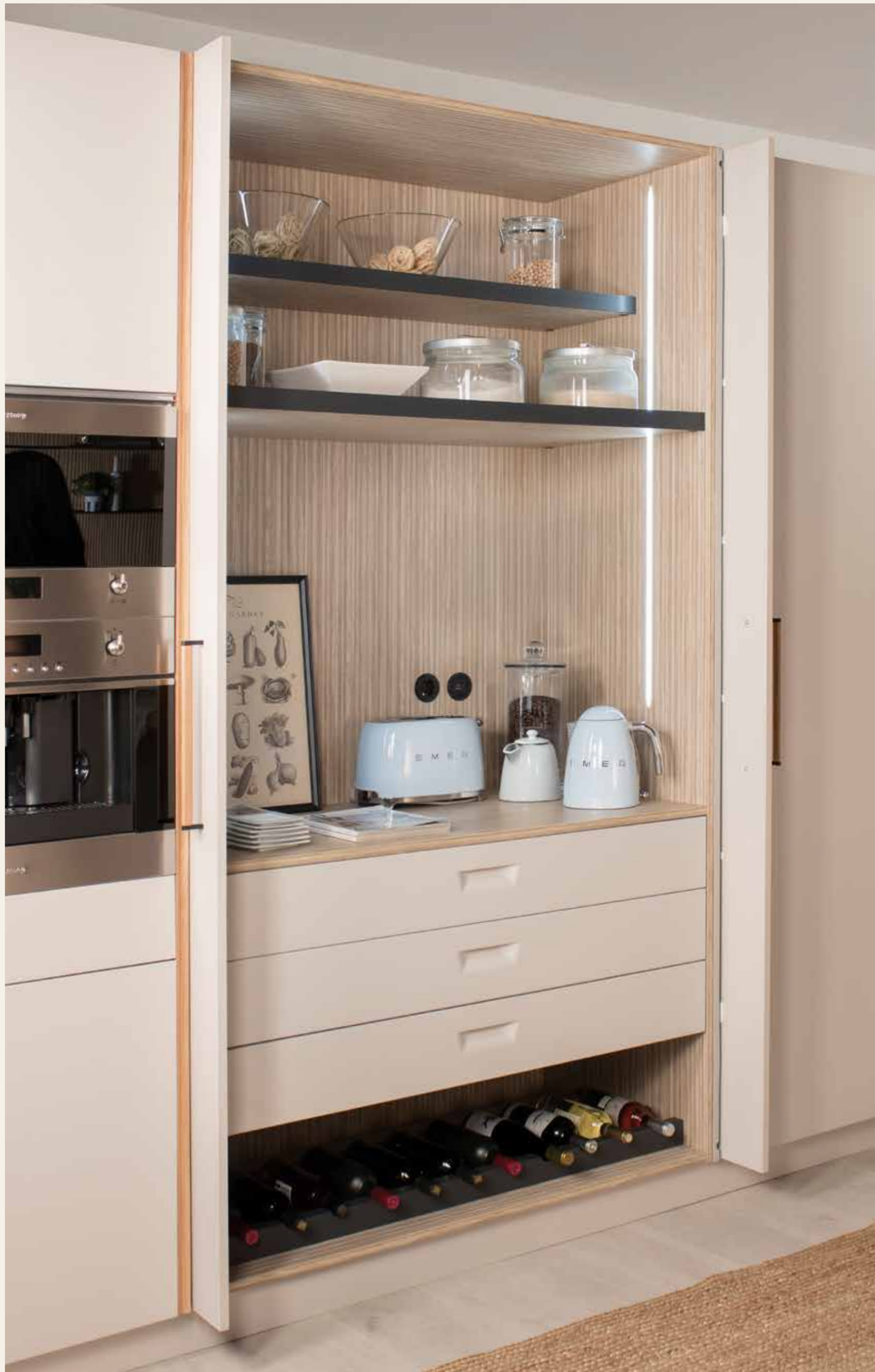
THE INTERIOR OF THE BREAKFAST BAR, IN LIGHT TOBAGO, WITH ITS OWN INTEGRATED LIGHTING AND RETRACTABLE DOORS, MAKE IT A UNIQUE PIECE.