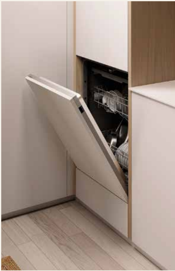
RAISED DISHWASHER: MORE COMFORTABLE, NO BENDING OVER. YOU TAKE CARE OF YOUR BACK AND GAIN IN

“Among the aspects I like most about my kitchen, I would highlight its feel. For me, opening a drawer or running my hand along the panelled wall means feeling the softness and warmth of the wood.”