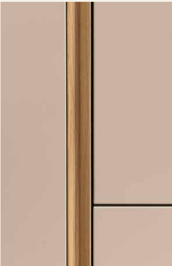
THE BASE UNITS HAVE A CONVENIENT OPENING SYSTEM PUSH WITHOUT VISIBLE HANDLES.