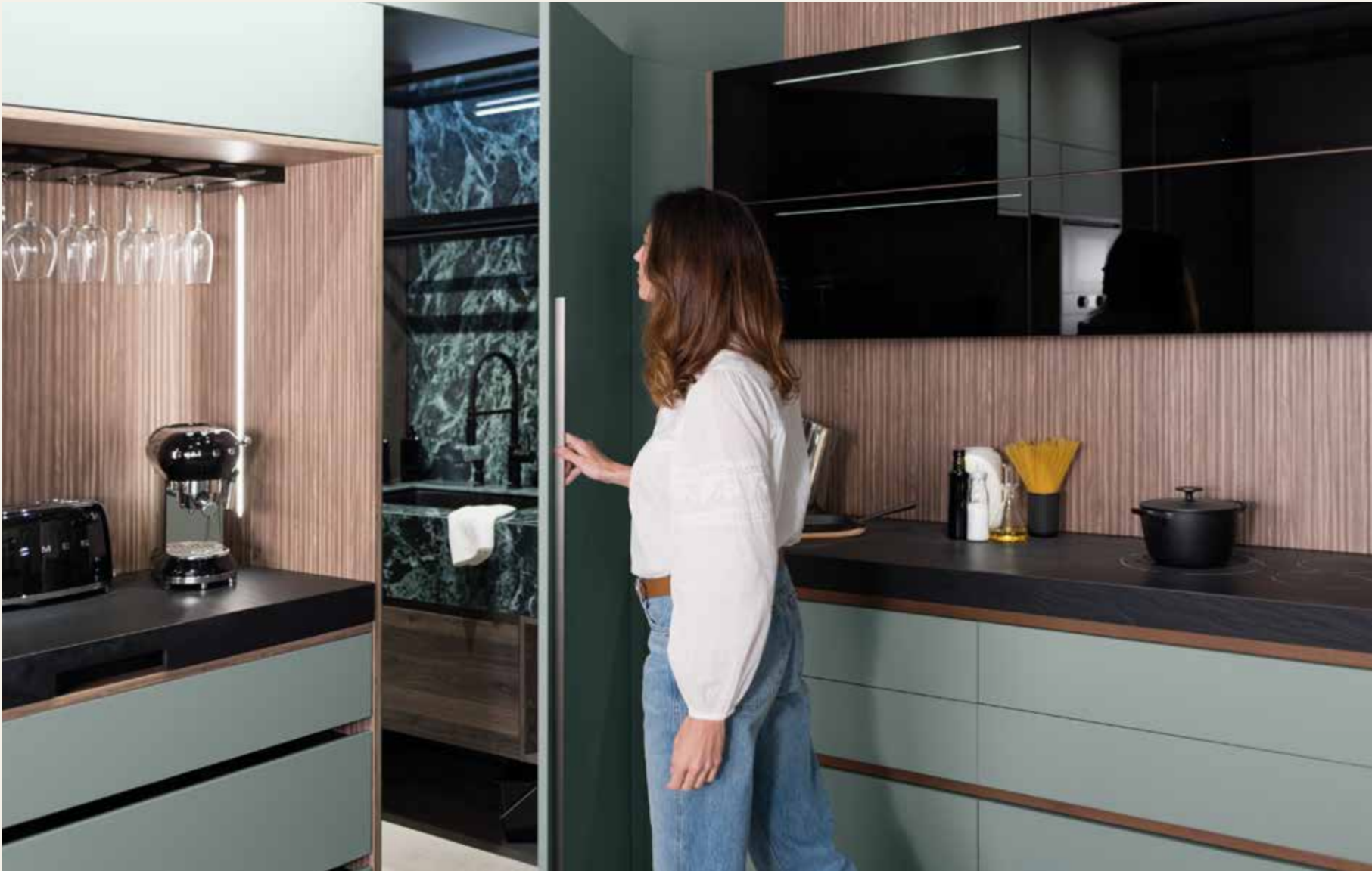
THE PASSAGEWAYS BETWEEN ROOMS ARE INTEGRATED TO CREATE LARGER SPACES, IN THIS CASE THE DOOR GIVES ACCESS TO THE LAUNDRY ROOM.